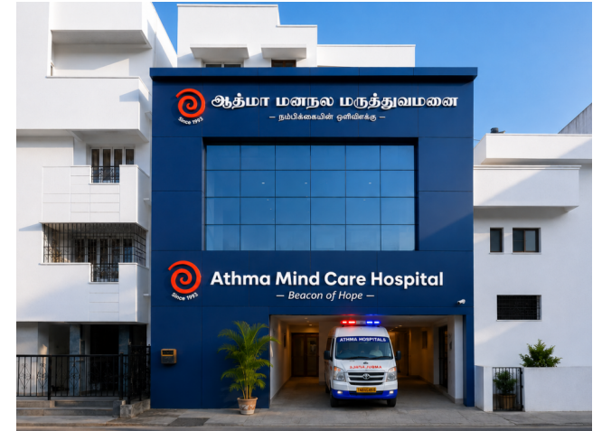
Gandhi Nagar, Erode