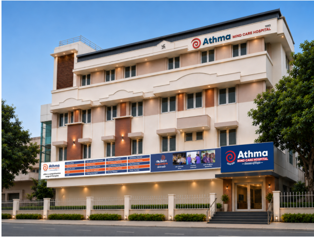
Thillai Nagar, Trichy