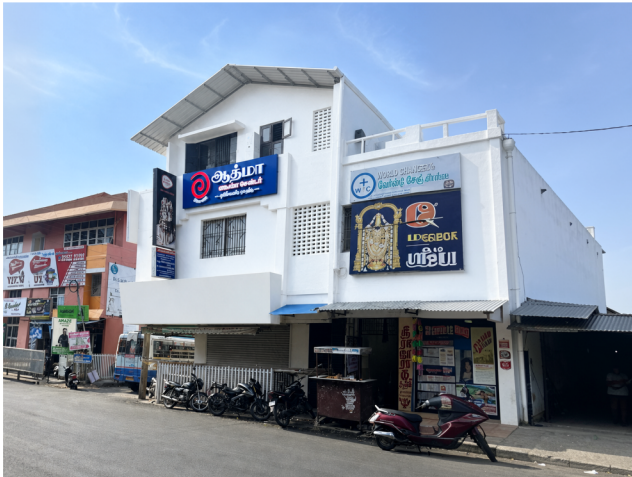
John Selvaraj Nagar, Kumbakonam