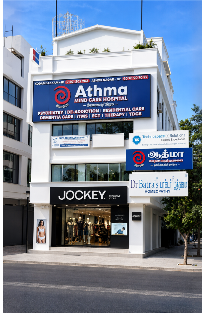
Ashok Pillar, Chennai